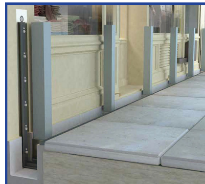
Cover At Grade